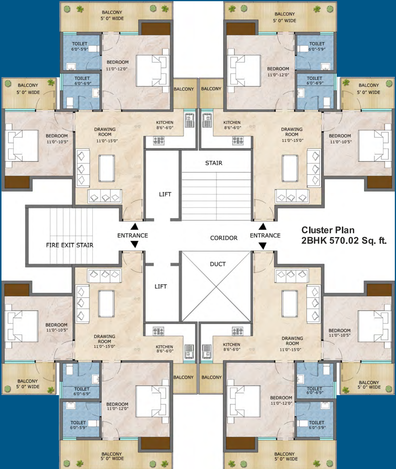
Cluster Plan 2BHK 570.02 Sq. ft.