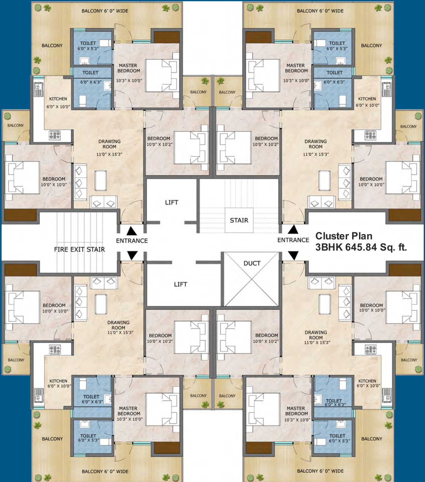
Cluster Plan 3BHK 645.84 Sq. ft.